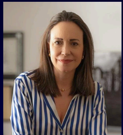
María Corina Machado Nobel Peace Prize Laureate Human Rights Advocate