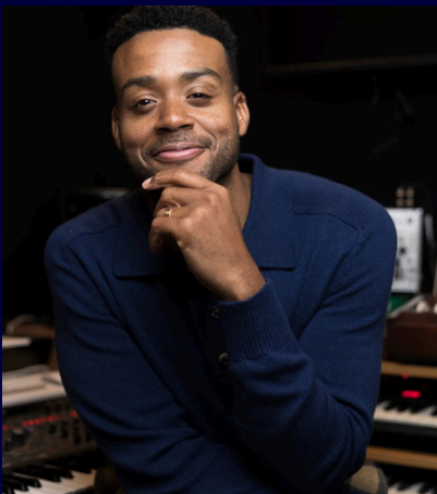
Kris Bowers Composer and Filmmaker Academy Award Winner