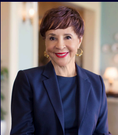
Sheila C. Johnson Entrepreneur & Philanthropist BET Co-Founder

Proceeds support transformative initiatives, including the OAcademy Music Conservatory and the Global Leaders Institute, helping talented leaders access world-class education, mentorship, and opportunities to create lasting impact in their communities and professions.