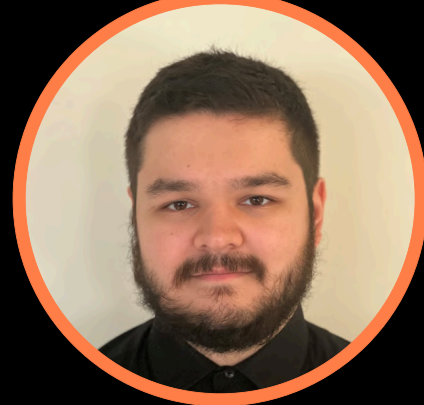
Paul Robeson USA